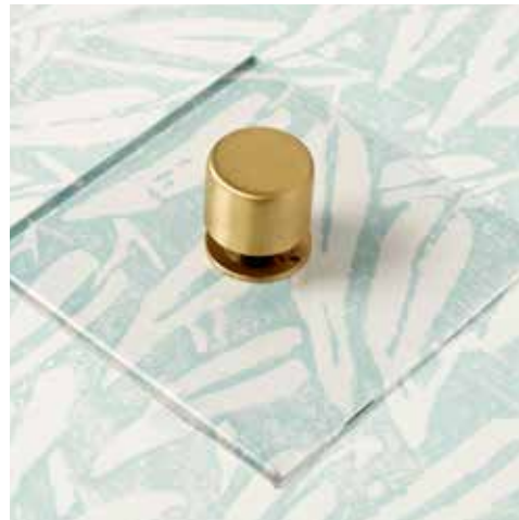
2 Gang Invisible Dolly & Button Dimmer - 4 Gang Invisible Dolly Switch 1 Gang Invisible Rotary Dimmer