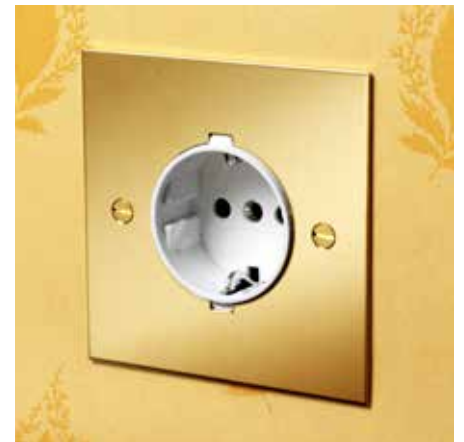
Unlacquered Brass German socket with white insert