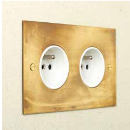
Aged Brass double French socket with white insert