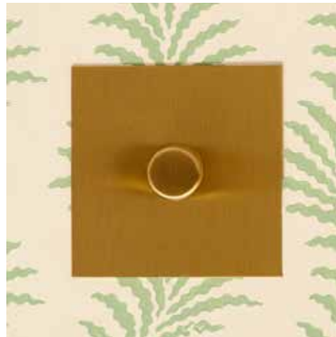
3 Gang Vertical Brushed Brass Dolly Switch - 2 Gang Brushed Brass Dolly Switch 1 Gang Brushed Brass Rotary Dimmer