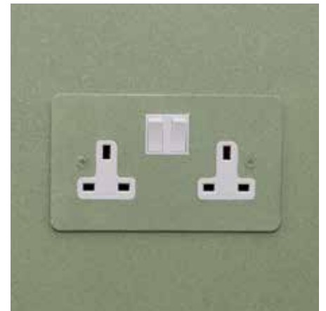
Painted 13amp socket with white insert