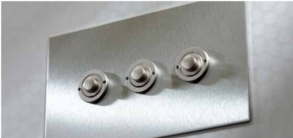
1 Gang Stainless Steel Rocker Switch - 1 Gang Stainless Steel Dolly Switch 3 Gang Stainless Steel Button Dimmer