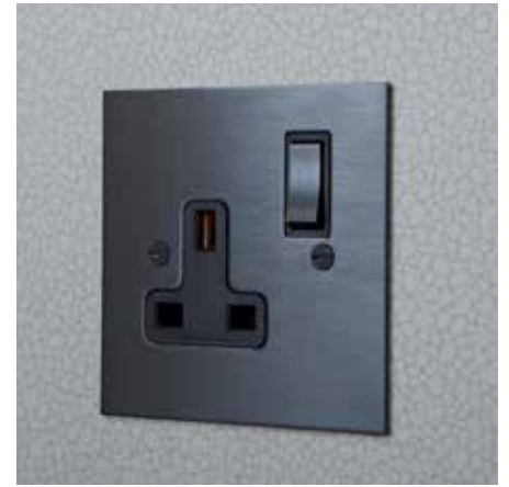
Antique Bronze 13amp socket with black insert