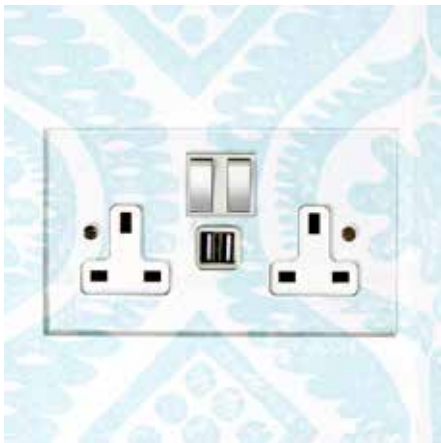
Invisible 13amp socket & USB with white insert