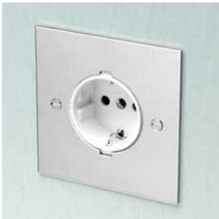
Nickel Silver German socket with white insert