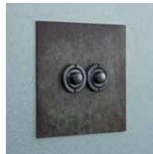
Stainless Steel Aged Brass Nickel