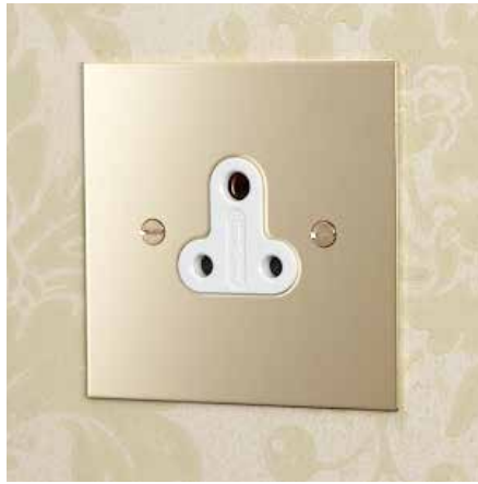
Unlacquered Brass 5amp socket with white insert