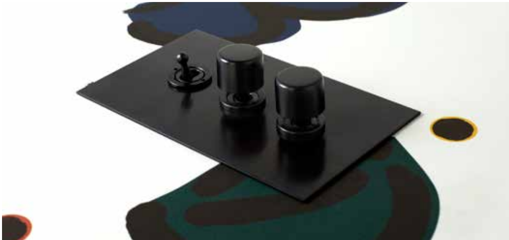
1 Gang Antique Bronze Dolly Switch - 1 Gang Antique Bronze Switch With Black Rocker 3 Gang Antique Bronze Dolly & Rotary Dimmer Combination