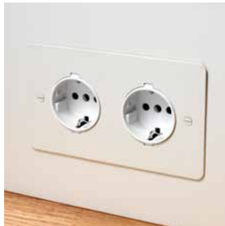
Painted double German socket with white insert