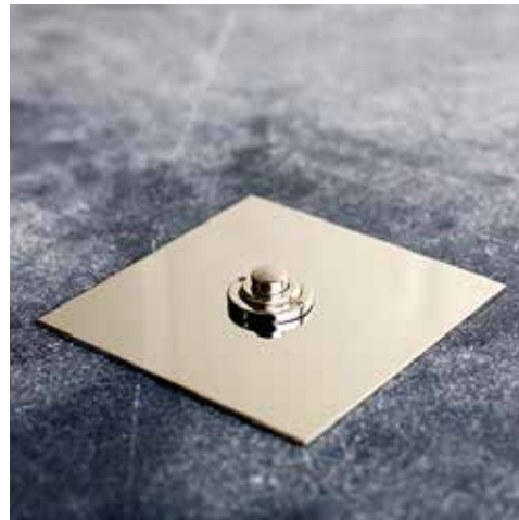
1 Gang Nickel Silver Rotary Dimmer - 2 Gang Nickel Silver Dolly & Dimmer Combination 1 Gang Nickel Silver Button Dimmer