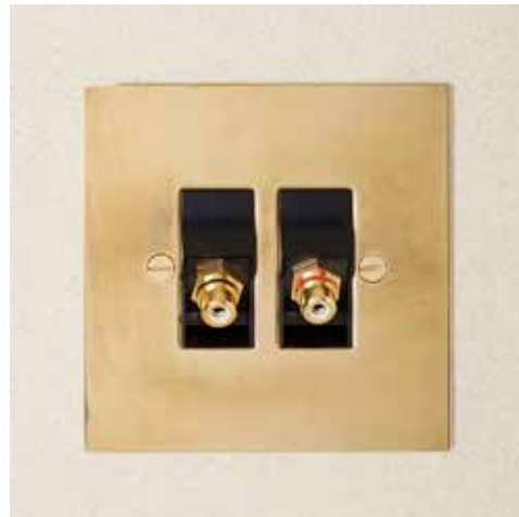
3 Gang Nickel Silver Combination Plate Invisible AV Media Plate - 2 gang Aged Brass Phono Socket