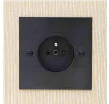
Antique Bronze French socket with black insert