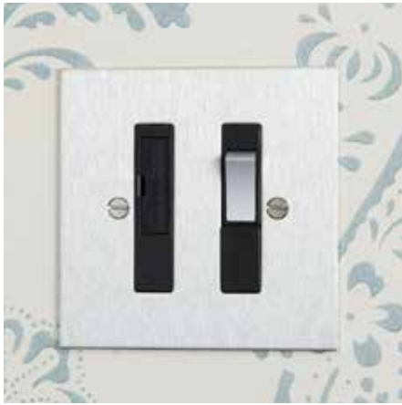
Switched Fuse Spur in Stainless Steel