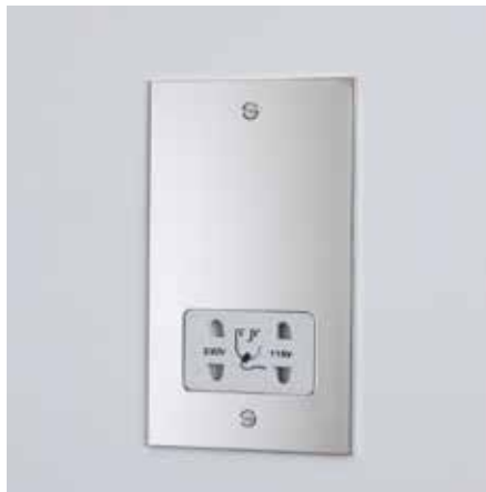
Nickel Silver shaver socket with white insert