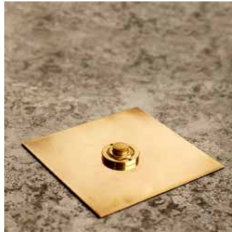
1 Gang Aged Brass Dolly Switch - 1 Gang Aged Brass Button Dimmer 1 Gang Aged Brass Dolly Switch