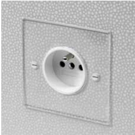
Invisible French socket with white insert