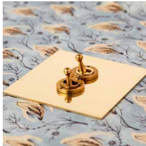
3 Gang Unlacquered Brass Dolly & Rotary Dimmer Combination 2 Gang Unlacquered Brass Dolly Switch - 1 Gang Unlacquered Brass Dolly Switch